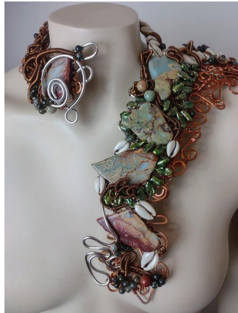
Clarissa Knighten Spiritual Transcendence (2023) 2D Jewelry / Mixed Materials on Copper 13" inch neck