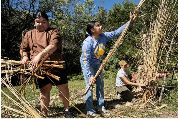
Julie Denesha Thatching (2023) Archival Print 13" x 19"