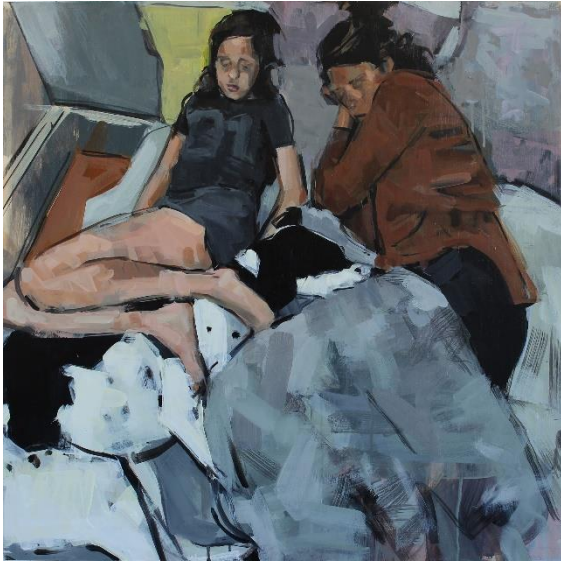
Dean Kube Sleeping Family (2021) Acrylic on Cradled Birch 30" x 30"