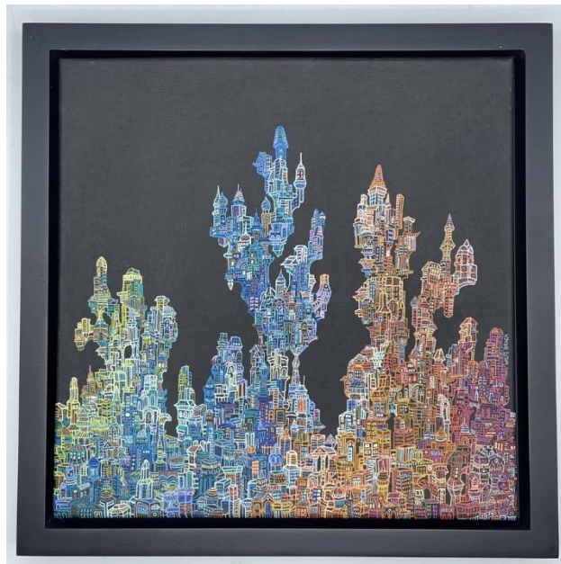
Wolfe Brack Urban Sprawl #7 (2023) Acrylic on Canvas 12" x 12" $400