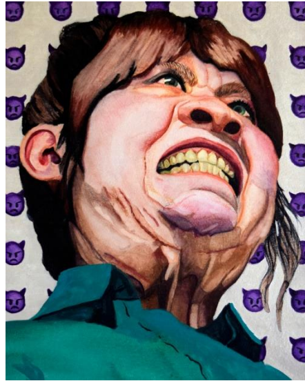
Anson DeOrnery Woman with a Grimace (2023) Watercolor on Paper 22" x 17.5"