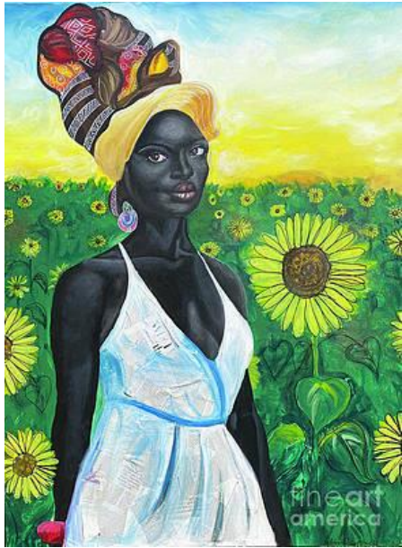
Adrienne Clayton A Rare Bloom (2022) Oil on Stretched Canvas 36" x 48" $3500