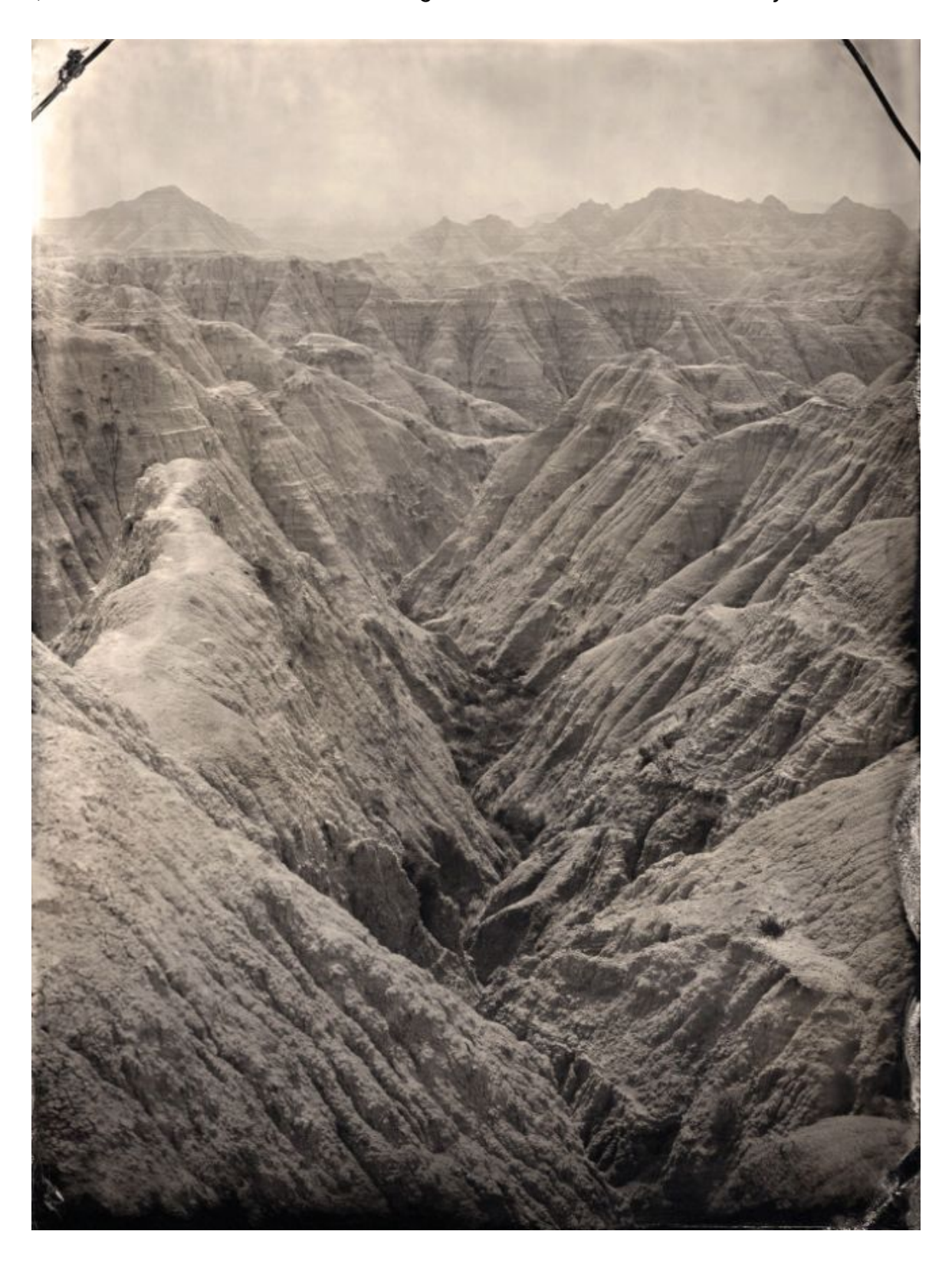
Megan Karson Badlands 22\text{"} \times 28\text{"} \text{ framed} Edition of 1 of 3 print from tintype on Hahnemühle photo rag $600